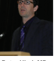
Peter Ubel, MD

Nearly 110 participants from 10 states braved the elements to attend the first-of-its-kind conference Empirical Bioethics: Emerging Trends for the 21st Century Feb. 21-22 at UC's Kingsgate Conference Center. Empirical bioethics involves the measurement and evaluation of ethical principles. Speakers included internationally recognized experts in the application of bioethics to clinical research and medicine. Scheduled sessions generated a lively interchange between the audience and presenters, which carried over into the first day's reception and networking lunch the following day.