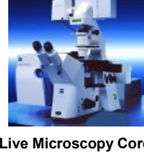
Live Microscopy Core

The CCTST Just-In-Time (JIT) grant mechanism enables investigators to use participating UC or CCHMC core facilities to obtain critical data for submission of a competitive extramural proposal, patent application or commercialization agreement.