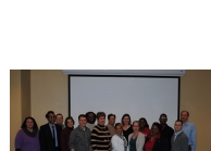
CLI Class of 2015